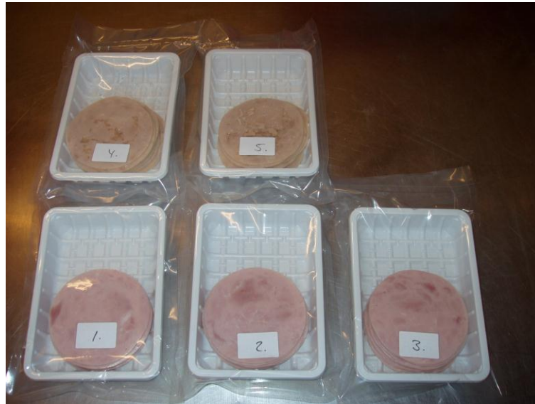
Slices from the five batches of hams with either 0%, 5%, 10%, 15% or 20% added MPE (batch 1, 2, 3, 4 and 5).