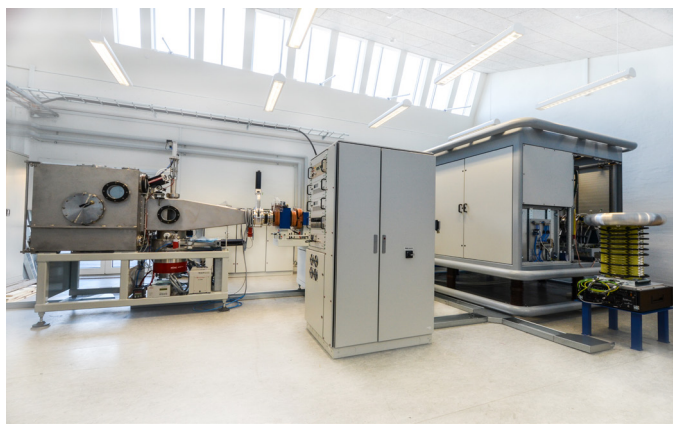
Figure 2: Danfysik 1090 high current ion implanter

Scanning a proton beam over e.g. 100 cm<sup>2</sup> will correspond to a total proton dose of 5.25×10<sup>13</sup>, which is attainable within hours with the new high-current Danfysik 1090 ion implanter hosted by Danish Technological Institute.