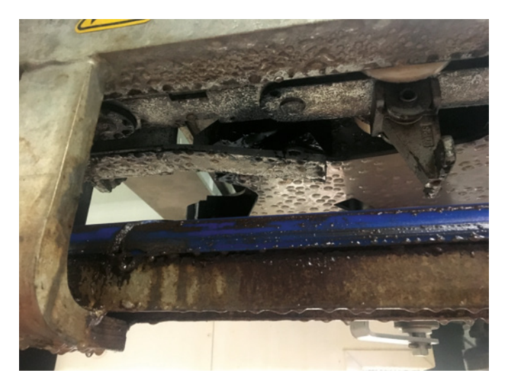
Risk of lubrication contamination

CONTROLLING THE ROOT-CAUSE of condensation issues is the most effective way of reducing the occurrence. DMRI has extensive knowledge of process design in slaughterhouses where massive generation of warm and humid air must be tackled by proper design and installed equipment to ensure a dry building structure around the production.