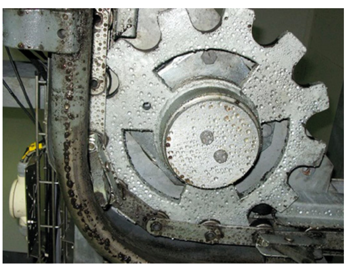
Conveyor structure dripping