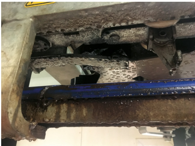
Risk of lubrication contamination

CONTROLLING THE ROOT-CAUSE of condensation issues is the most effective way of reducing the occurrence. DMRI has extensive knowledge of process design in slaughterhouses where massive generation of warm and humid air must be tackled by proper design and installed equipment to ensure a dry building structure around the production.