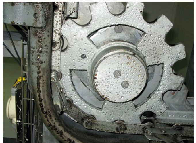
Conveyor structure dripping