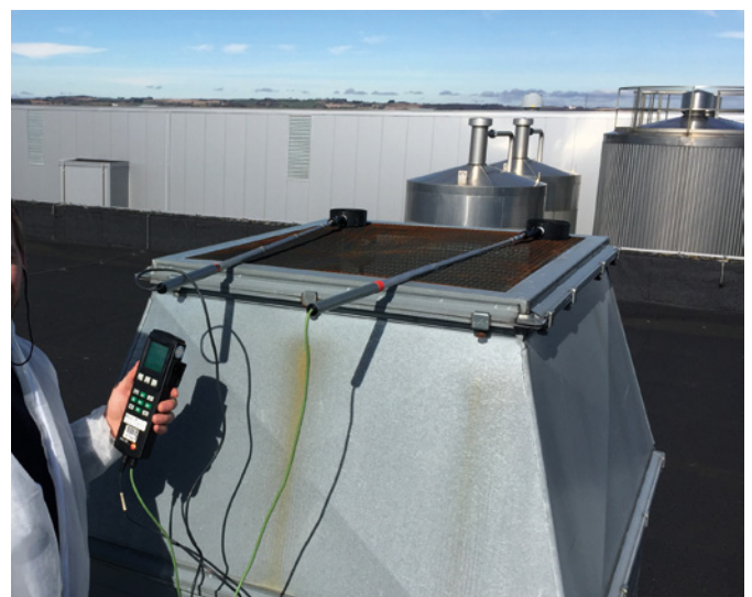
On-site air flow measurements

Act now and minimize the issues in your production to increase customer satisfaction and the hygienic conditions under which you are processing.