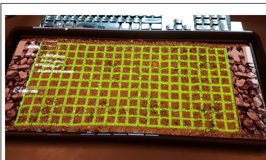
Figure 1. The simulated meat object for the benchmark of four different AR channels. Please, find a detailed description in https://link.springer.com/chapter/10.1007/978-3-030-05297-3_7

The benchmark has been made with a simulated piece of meat where submerged contaminants were inserted to mimic bone fragments in meat. The tested channels include a tablet, a set of smart glasses, a video projector and a video monitor. The operator performance is measured with a HTC VIVE based tracking system with a pointer attached to the controller. From the controller the 3D position of the pointer is recorded together with the time consumed for the task, leading to a capacity and quality measure for the 3D operation of pointing out the submerged contamination.