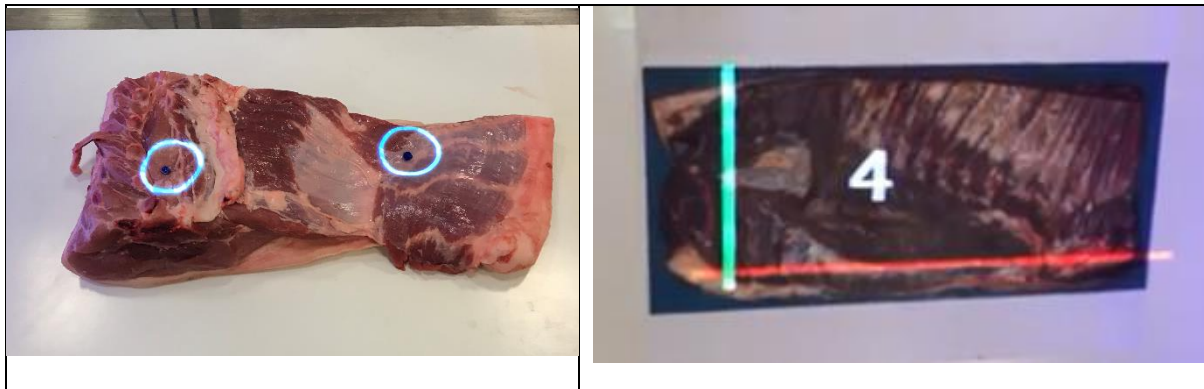
Figure 3. The pilot setup assists the operator in producing an optimized yield of the raw material (right) by cutting along the projected lines in a specific order (green before red) and performing a corrective action by removing blue polymer fragments detected as surface contamination (left). Videos will be presented at the conference.

The calculated cutting lines are projected on the meat surface to guide the operator in performing the optimized cutting operation. The sequential order of the two cutting procedures leaves a significant volume of meat on either of the two trimmings: the caudal (hip) or ventral (belly) part. Actual price differences between the two parts may influence the yield of a specific cutting sequence. In our pilot setup, the sequential order of cutting is communicated to the operator using color codes, see Fig. 3. The sequential order of cutting leaves the lower left-hand cutoff either on the ventral or the caudal part. As these by-products often are priced differently, an optimization potential is available for the operator by selecting a specific cutting sequential order.