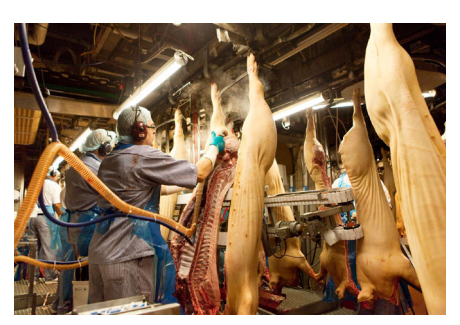
STEP 3 Implementing the necessary changes

Relevant KPI's will be benchmarked against best practice. Possibilities of water savings will be described, and the water saving potential will be calculated and prioritized based on the investment required and the estimated payback time.