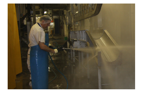
STEP 2 Identifying the water saving potential

Using a systematic approach, your current level of water consumption will be mapped. The mapping comprises the entire production line including truck wash, fat rendering, casing department and cleaning.