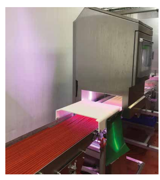
Two side screening of sausages for plastic casing remnants.

The DynaCQ Dual solution applies a top camera measuring the sausage top surface, and a lower camera measuring the lower side through a gap in the belt.