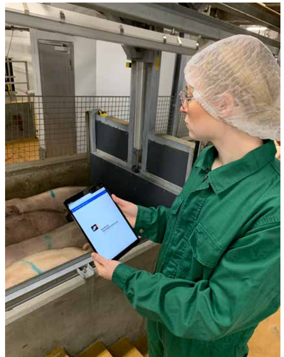
By use of the WQC app the slaughterhouse will be able to continue to monitor animal welfare after DMRI's experts have left.

The concurrent training of slaughterhouse employees ensures implementation of the WQC system and the app as well as ongoing focus on animal welfare.