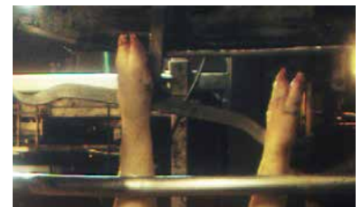
incorrect position of feet

ABOUT US Reduce your environmental impact and boost your business. Partner with us to fully utilise your resources and minimise production waste without compromising product quality and food safety. Based on our extensive R&D programmes and 70 years of experience in the international meat industry, you will be able to draw on our unparalleled services.