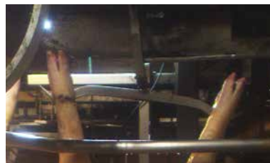
Gambrel to be flagged for inspection