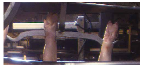
Incorrect feet and reverse position of carcass

The DPM Gambrel Control system checks if every gambrel is within specification and will flag faulty gambrels for repair or disposal.