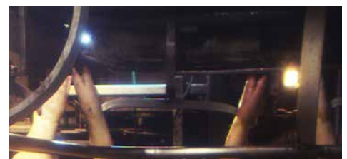
Correct position of carcass