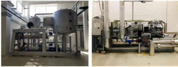
Figure 2 - Seawater and NH 3 heat pump system at Aarhus Ø (AVA) used for case study I.

applications of such models will also include data from wireless sensors based on IoT.