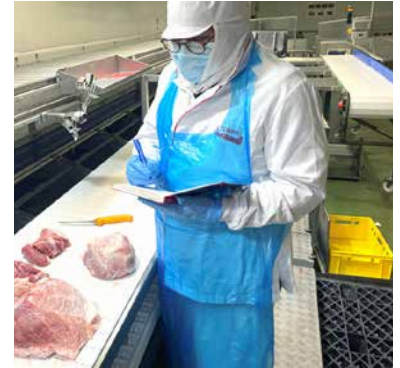
DMRI consultant conducting a cutting test

Thanks to the Enhanced Yield Boost program and the involvement of Frigolouro's entire staff, the project achieved even better economic results than anticipated, with significant increases in value and quality improvements. Since our collaboration began, Frigolouro has also benefited from new work methods and managers gaining more continuous focus on Key Control Points and Key Figure Management, which has certainly helped us to achieve more uniform meat cuts.